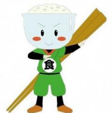
Utsunomiya City dietary education support