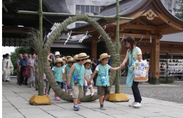
Children going through the thatched circle

“Ooharai celemony” is an event that has been done since 701 so that people will not become sick and so that bad things will not occur, and is held on June 30 and December 31 each year. The thatched circle is made of wrapped straw stalks, in a circle shape with an approximate 2m diameter. When you go through this circle it is said that you will escape from illnesses and bad things, and be able to live a long life.