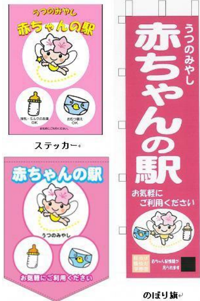
< Baby Station signs >