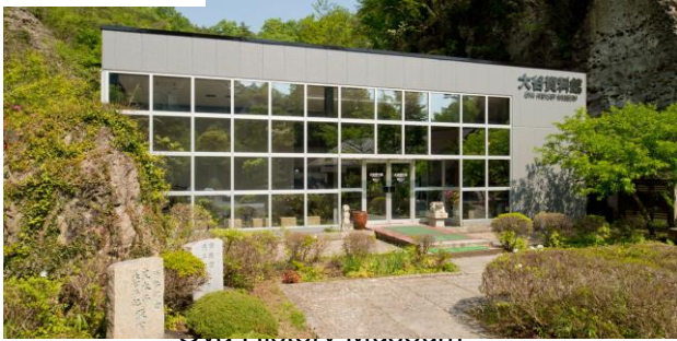
Oya History Museum

I will tell you about the Oya Museum, a famous tourist destination in Utsunomiya City.