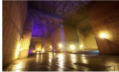
Huge mining site (underground)

The Oya History Museum's underground excavation site is a very large underground space made from digging Oya rock over a period of about 70 years from 1919 to 1986. Its size is 20,000 square meters (140m x 150m), and it is about the size of a baseball field. The average annual temperature inside is around 8 degrees and it is like a large refrigerator underground. During the war it was used as a secret factory, after the war as a warehouse for the government's rice, and now as a concert and movie studio.