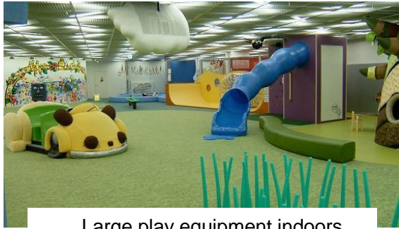
Large play equipment indoors

This is information on the “Yuai Hiroba,” where kids can play. At the same place there is a short time care space and Family Support Center.