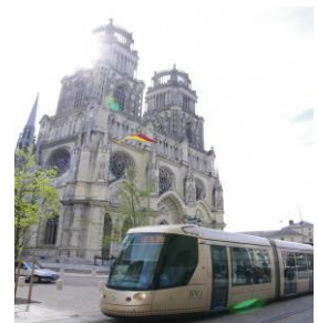
LRT passing in front of Sainte Croix Cathedral

It's because of the sister city relationship that citizen exchanges can take place. I recommend that you go to Paris while homestay in Orleans or studying there as an exchange student. In addition, there are various experiences and exchange programs that are possible because it is a sister city. Please take advantage of this, and visit the city of Orleans.