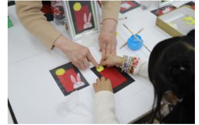
Torn paper collage

Really? I'm jealous! Where did you try it on? I also want to try wearing one!