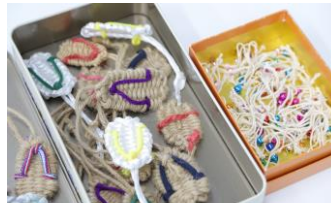
Mini straw sandals