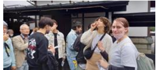
Japanese sake tasting experience on a facility factory tour

UCIA offers a variety of international exchange opportunities, such as through Japanese language classes, foreign language courses, explanations on Japanese culture, bus tours, facility factory tour trips, cooking classes, etc.