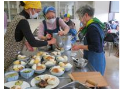
Japanese cooking class

Also, in cooperation with Utsunomiya City, UCIA accepts students from sister cities (for homestays) and dispatches junior high and high school students abroad as well.