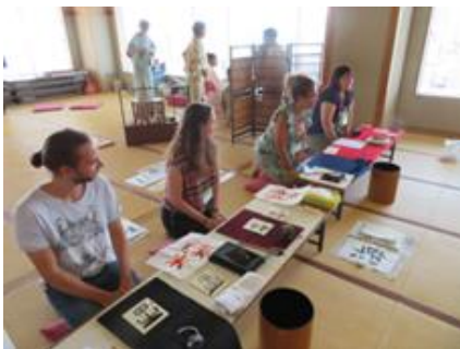
Calligraphy experience at a homestay

Next time, I will invite my friends to go!