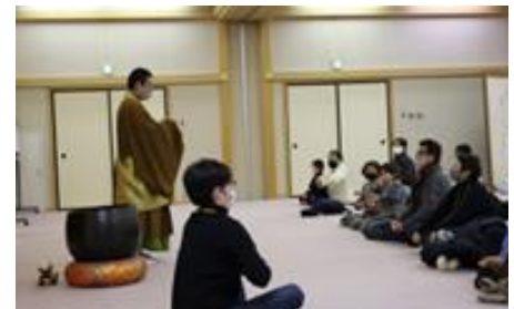
Zen meditation experience on a bus tour

UCIA also offers comprehensive consultations for foreign residents (page 4) and interpreting/translation services (fees apply).