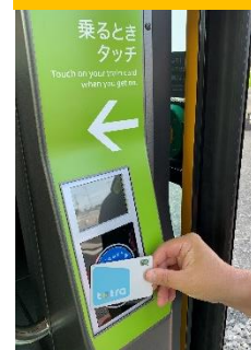
Getting on (green)