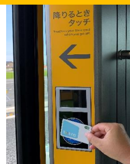
Getting off (yellow)