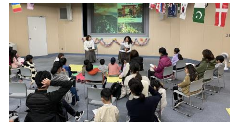
Enjoying picture books from around the world

In cooperation with Utsunomiya City, UCIA is also engaged in programs to receive students from sister cities, dispatch junior high and high school students, etc.