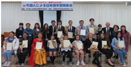
Japanese language study presentation

UCIA: U tsunomiya C ity I nternational A ssociation