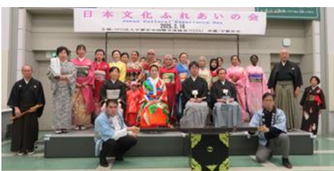
Japanese cultural experience

As you can see on page 4, you can introduce yourself and your country of origin to the community, so please come and check out UCIA sometime!