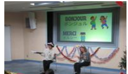
Enjoying picture books

In cooperation with Utsunomiya City, UCIA is engaged in programs to receive students from sister cities (homestays) and dispatch junior high and high school students, etc.