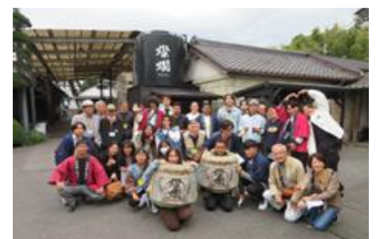
Facility factory tour

UCIA also offers general consultation in various languages (page 4) and interpreting and translating services (fee-based).